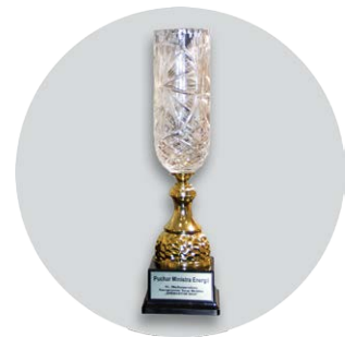
The Minister of Energy Cup ENERGETAB 2018 Fairs