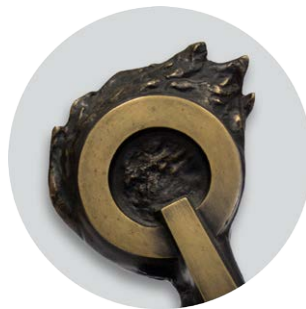
Masovian Quality Award