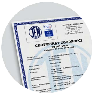
IEEn compliance certificate no 067/2020